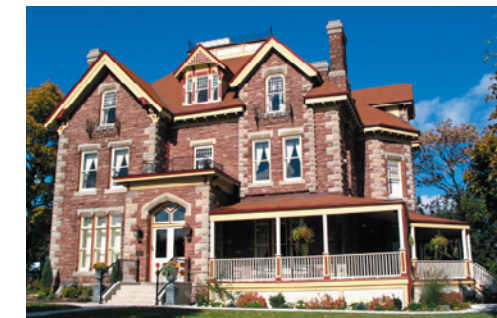
The newest member of Ontario's Finest Inns, the Keefer Mansion, Thorold, Ontario.

• You'll find Ontario's Finest Inns represented in cities across Ontario. The Carmichael Inn & Spa is close to the Rideau Canal in downtown Ottawa. The Rosemount Inn is in downtown Kingston. The Old Mill Inn & Spa is in the west end of Toronto. The historic Waterloo Hotel is in Kitchener-Waterloo, and the Idlewyld Inn is in downtown