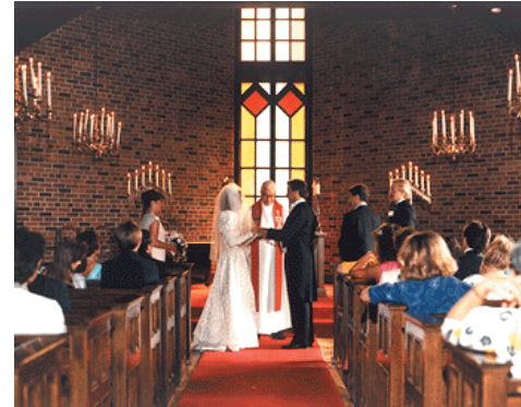
The Old Mill Inn Chapel in Toronto. One of four inns with on-site chapels

• Four of Ontario's Finest properties have chapels on site, including Niagara's Inn on the Twenty which has its own vineyard chapel.